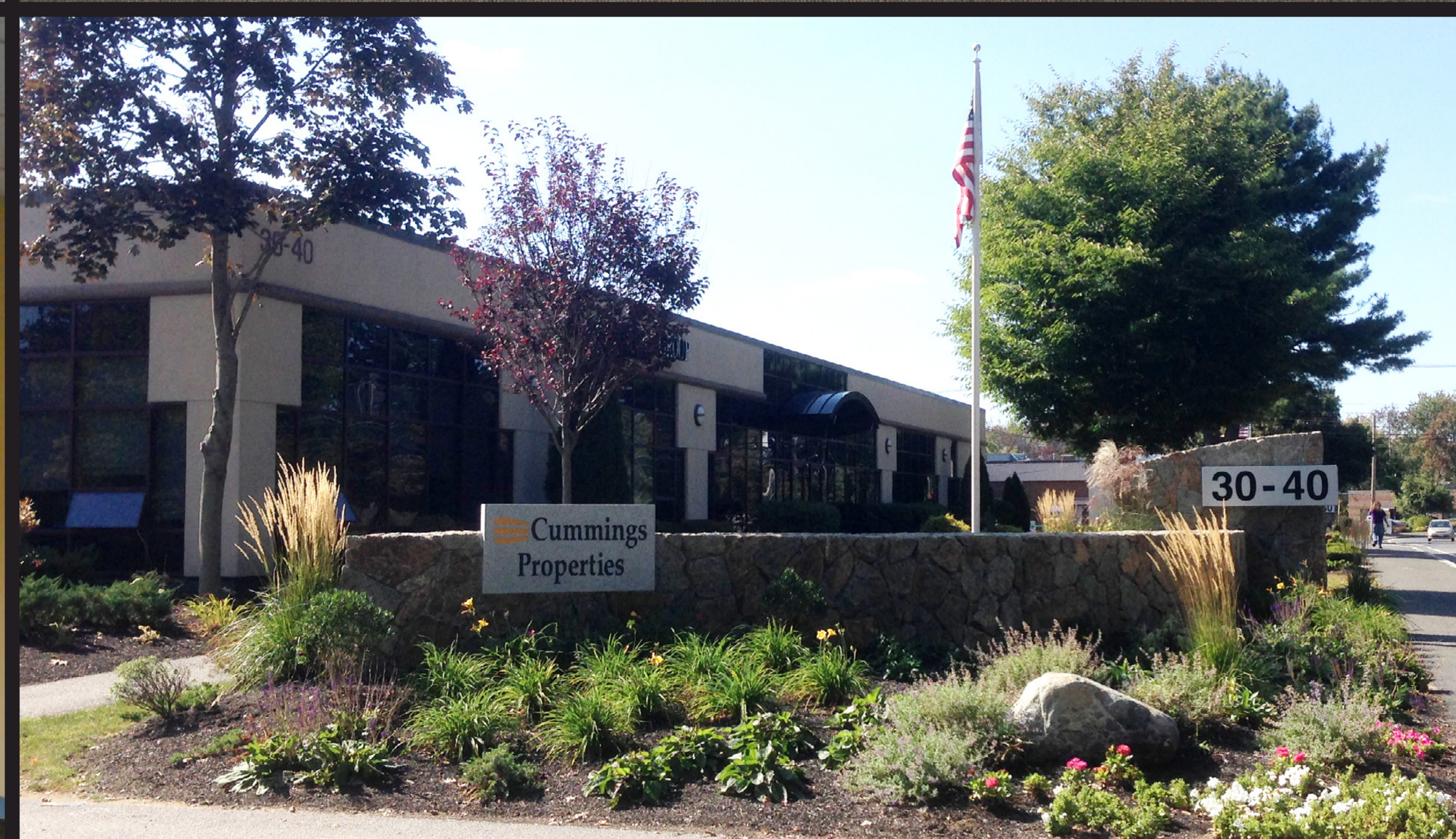
Audubon Road, Wakefield